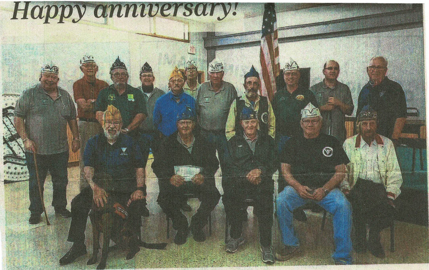
Members of Aberdeens 40&8 chapter.