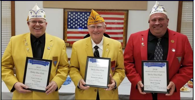
The last members ever to be inducted into the "Dicky Doo Club" by the Grand Voiture du Indiana.